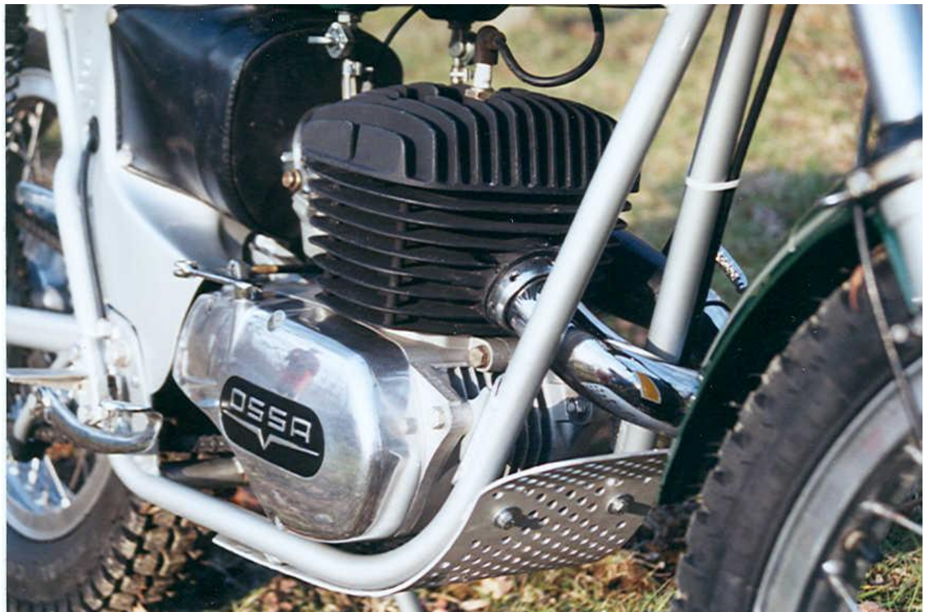
250cc 4-speed motor